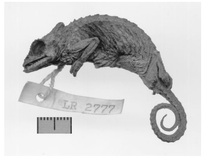
Figure 3. Bradypodion coeruleogula n. sp., holotype (LR 2777).

Bradypodion nemorale (non Raw, 1978) Branch, 1998.