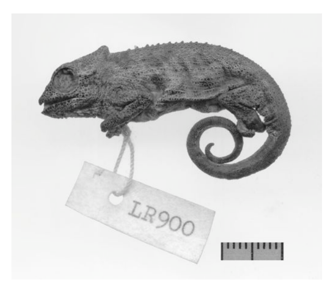
Figure 2. Bradypodion nkandlae n. sp., holotype (LR 900).

Synonomy. Bradypodion nemorale Raw, 1978: 265-269; Raw, 1995: 19. (in part, Nkandla Forest specimens only).